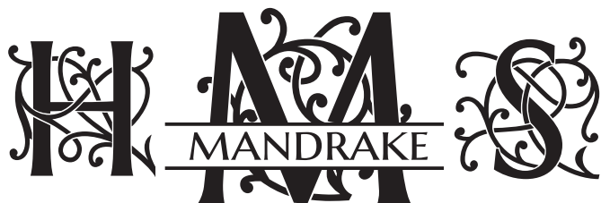
MFC Mercer Split-Regular

The MFC Mercer Split family comes complete with a customized version of Marcellus Pro, by our sister foundry Stiggy & Sands, in which the typeface has been setup as a smallcaps, numerals, and basic punctuation only font, scaled down to perfectly layer in position and combine with the MFC Mercer Split typefaces. All you need to do is horizontally center the TinyCap text.