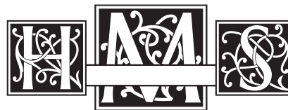
MFC Mercer Split-Cameo Typeset any combination of Cameo Capitals and lowercase to your needs