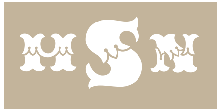
Copy and paste the monogram, switch to the Fill font and change the color.