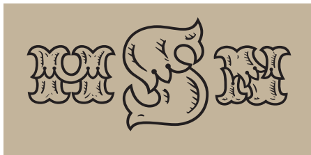
Create your monogram using the Regular font

The MFC Redding Monogram family includes five additional fonts, MFC Redding Fill, MFC Redding Top, MFC Redding Bottom, MFC Redding Extruded, and MFC Redding Clear. You can use them all to create awesome 3 and 4-color chromatic monograms! To utilize these fonts, simply type your monogram using the Regular font, then copy and paste the monogram in another layer and change to the Fill font. Repeat this step, and this time change to the Extruded font. Now that you have three separate layers you can color and organize them. Order the layers so that the Extruded layer is on the bottom and the Regular layer is on top, and the Fill layer(s) in-between. With this font, it is easier to align the Regular and Extruded layers first, then drop in the Fill layer. When positioned correctly, the Extruded layer will align with the Regular layer on the top and left side, and the Fill layer(s) will align in the center. You may have to zoom in to get the registration right.