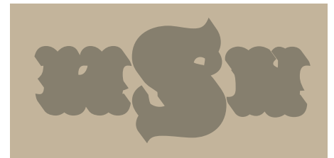
Copy and paste the monogram, switch to the Extruded font and change the color.