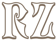
Two letter monogram

The outline version of Royaume Monogram requires the Stylistic Alternates feature, available in most OpenType savvy applications, such as Adobe Illustrator CS (see Fig. 1). You can enable Stylistic Alternates and type out a monogram or text, or you can highlight an already setup solid monogram or text and enable Stylistic Alternates to change it to the outline style.