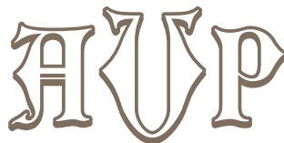
Three letter monogram

Type any lowercase + Capital + lowercase